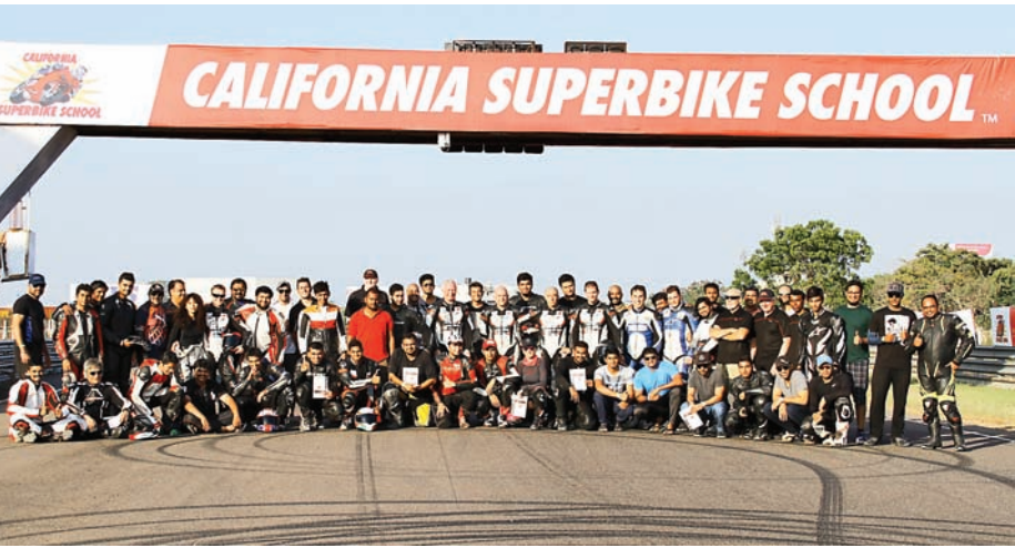
Participants pose with the coaches after a gruelling training session.