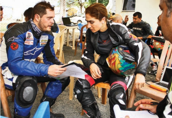
CSS coach gives feedback to a participant after a track riding session.

GETTING BETTER BY THE YEAR With over three decades of experience in training everyday commuters, MotoGP and World Superbike (WSBK) racers, the California Superbike School has trained over 1.5 lakh riders in as many as 27 countries. With the growing popularity of recreation motorcycling and the launch of world-class motorcycles in India, schools like the CSS are much-needed outlets to train petrolheads for optimally using the power on their saddles. Sarmad Kadiri