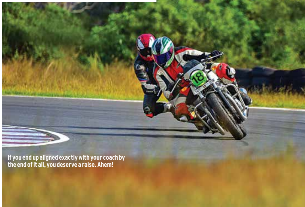
If you end up aligned exactly with your coach by the end of it all, you deserve a raise. Ahem!