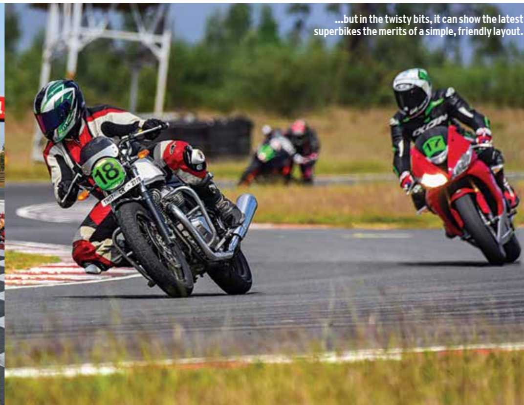
...but in the twisty bits, it can show the latest superbikes the merits of a simple, friendly layout.

nobody in this town would find any real use for racing leathers, or a tail bag that's breathing its last, I decided to leave it strapped to the motorcycle for the night. The lone security guard in attendance assured me of its safety and I was easily convinced. The next day would see me clock another 360km before I'd arrive in Sriperumbudur well in time to take possession of the Conti GT I'd been promised.