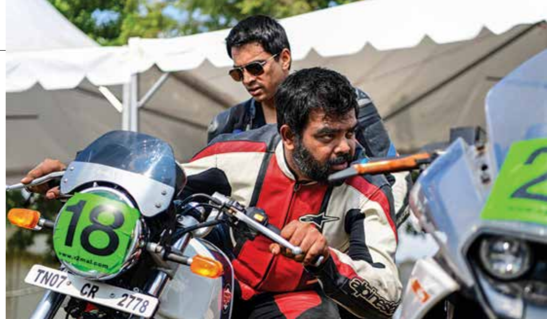
Trying to impress a CSS coach with your cornering abilities is easier with the side-stand down. Just kidding.

riding days – the perfect real-world test. It's no wonder I kept looking at my wristwatch every hundred kilometres or so. There was a sense of accomplishment waiting at the end of the road.