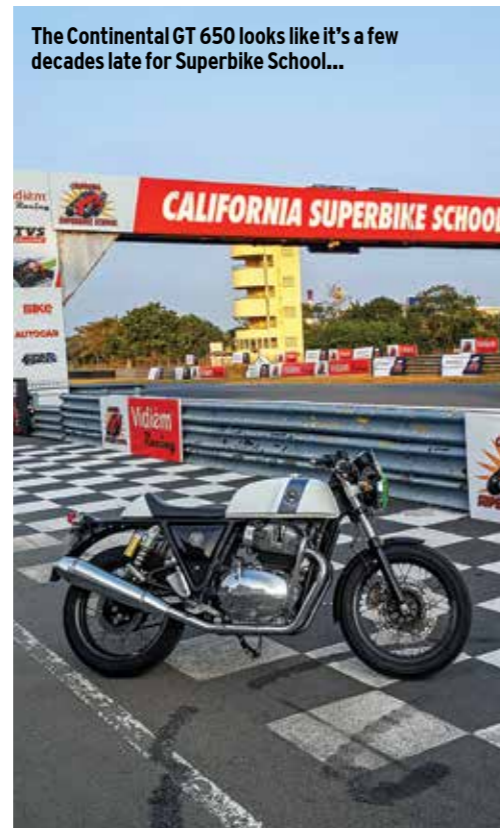
The Continental GT 650 looks like it's a few decades late for Superbike School...

As a growing motorcycling community, we are united by our quest for better days. We dream together, toil together, to make more motorcycles our own, to give them names, to figure out the uphill task that our lives tend to be in our own small ways. It just had to be about the motorcycles you and I are daydreaming about these days – the Royal Enfield twins. When RE's CEO, Sid Lal, comically revealed the prices of both bikes as a combined entity, only to further fuel the world's anxiety, he really did hint at a belief that implied you could fulfil most of your motorcycling dreams if you bought both together, for Rs 5.55 lakh or thereabout. Why not, come to think of it? Our modest means may limit us to owning just one big bike at a time – if not in an entire lifetime – but for the first time, you can possibly have two instead. The prospect tempted me no end. About five minutes after I had rearranged these thoughts to form one intelligible question, Royal Enfield's press man had confirmed he was going to fix me up with a Continental GT 650 in Chennai. This left me free to burden our long-term Interceptor with the 'Great Indian Highway' test, which would involve clocking a shade over 2,700km in four