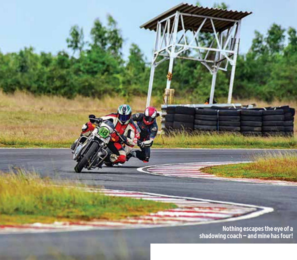
Nothing escapes the eye of a shadowing coach – and mine has four!