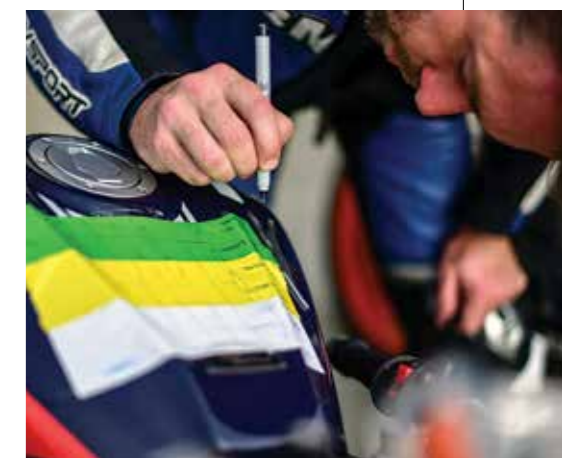
Instructors rate students while on the go! Pens get tucked into knee-sliders. Incredible!

Well before the sun had risen, I had showered, made myself coffee, stuffed myself into the once well-fitting leathers (let's call it evolution – ahem!) and set off for the racetrack. I had reached in 10 minutes, but it could have taken me five had I not managed to lose the way, making me the only person to ever get lost whilst going in a straight line. By the time I had arrived, the paddock was already busy, with lots of serious-looking men in official CSS T-shirts strutting about with notepads. The pit garages were crammed with mostly superbikes that had probably been tucked in the night before, having gotten here from all corners of the →