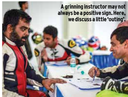
A grinning instructor may not always be a positive sign. Here, we discuss a little ‘outing’.

The onus, to begin with, is as much on learning as it is on unlearning. With the CSS being a product of real-world riders, starting from the legendary Keith Code, a lot of what you learn there is simply an exercise in transitioning from the conscious to the subconscious and, sometimes, the other way around. For instance, the very introduction to the CSS involves enlisting all the six controls one engages – the