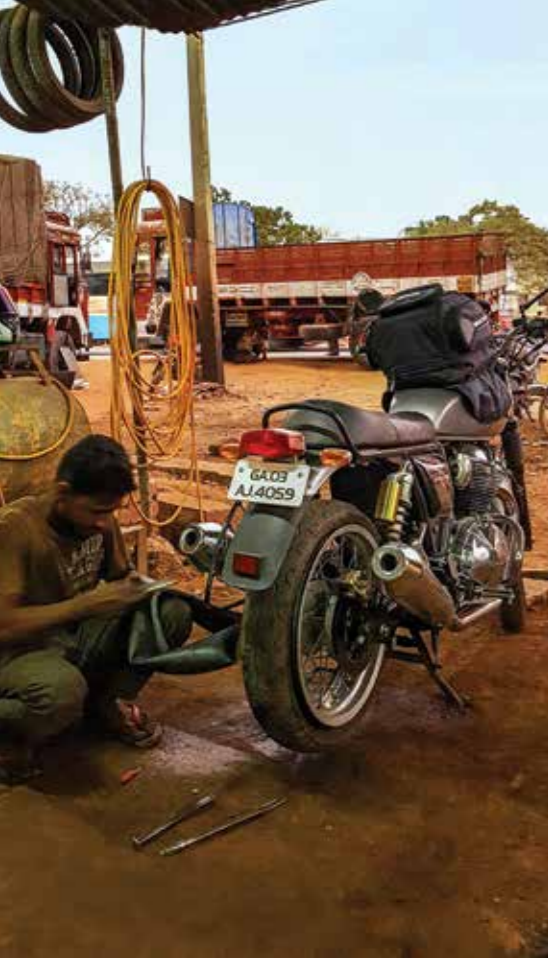
With no tyre removal machine around you, you're at the mercy of a hammer and some enthusiasm. Tubeless tyres, please?