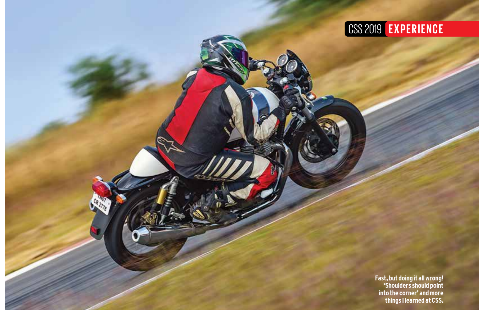
Fast, but doing it all wrong! 'Shoulders should point into the corner' and more things I learned at CSS.

“ Going faster would get me there early, but that would help only if I didn't enjoy being on the Interceptor. ”